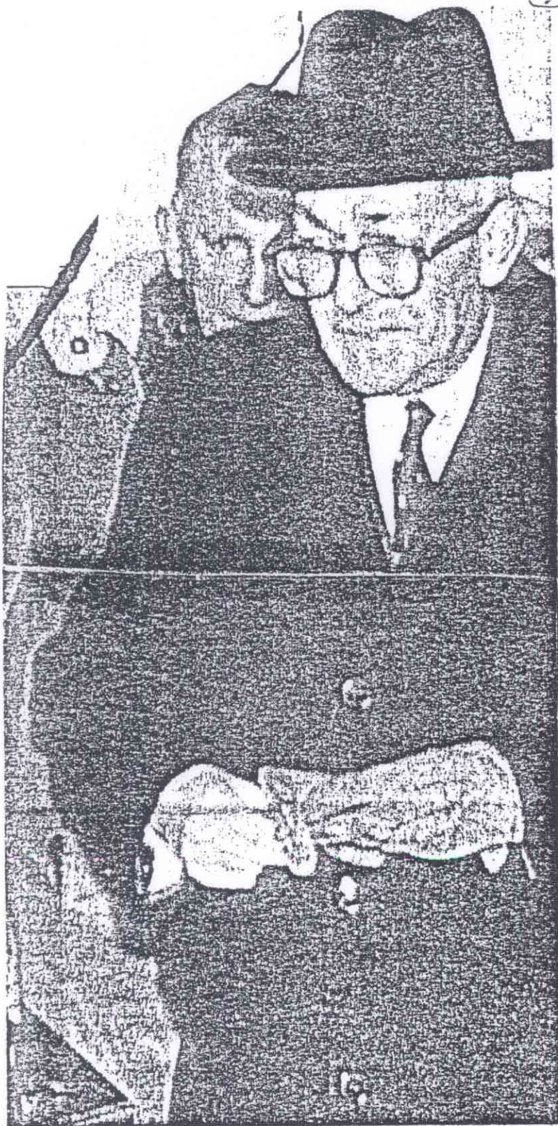
Angleton emerges from one of the 1975 Presidential panel hearings on the C.I.A.

This search seems even more appropriate today. Angleton once again has become relevant to the issue — grown almost into a national debate — of what the C.I.A.'s mission should and should not be. He is, in effect, waging covert