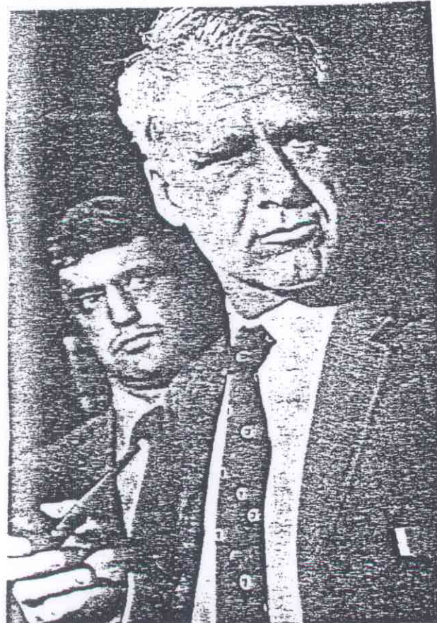
James Schlesinger as C.I.A. head in 1973: A controversial leader.