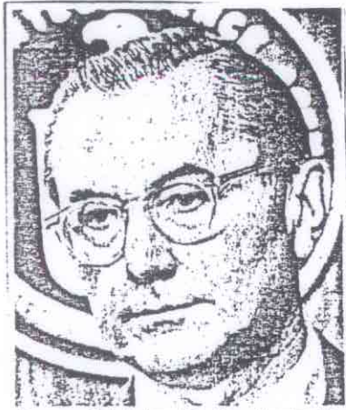
Former C.I.A. head Colby: "naive"?

One of the first things Nosenko told the C.I.A. when he came over in 1964 was that Oswald had not been recruited by the K.G.B. during his years in the Soviet Union. Angleton was skeptical. The Russian was placed in virtual solitary confinement and intensively interrogated for much of the next three years by Angleton and other counterintelligence men. Finally cleared as a credible source, Nosenko was relocated in North Carolina and placed on the C.I.A. payroll as a consultant. Angleton, however, remained convinced that Nosenko was a K.G.B. "disinformation" plant — even though, immediately after his defection, Nosenko had provided the C.I.A. with information that led to the arrest of at least two Soviet agents and to the shutting-down of a major K.G.B. ring in France that