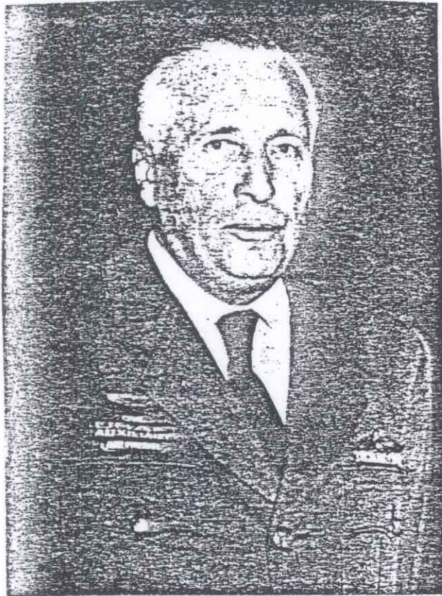
Army (and C.I.A.) officer Cord Meyer: A case of hero worship.

If we went deeper into that question, we might come to understand more. ■