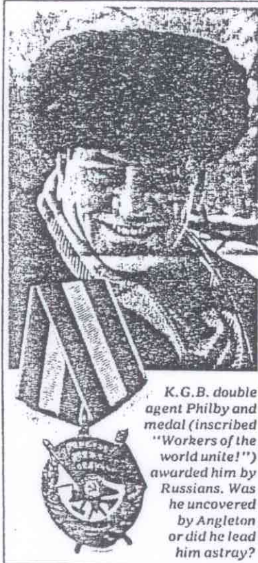
K.G.B. double agent Philby and medal (inscribed "Workers of the world unite!") awarded him by Russians. Was he uncovered by Angleton or did he lead him astray?

office was the most sacrosanct unit inside the C.I.A., a "deep snow" section whose operations were kept secret even from other top officials. There was no such indignity in Angleton's office as the annual investigation by the agency's inspector general, a period in which some of the other sections had to clean up and alter records to avoid curtailment of some unauthorized derring-do. His was a twilight world of defectors, disinformation, deception and penetration. His were among the most difficult judgments to be made in the global chess game between the intelligence services of the Soviet Union and the United States.