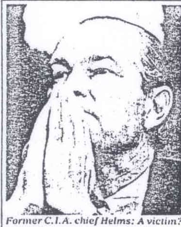
Former C.I.A. chief Helms: A victim?

can people and the Congress have to trust us. You can't legislate morality and integrity. We had a job to do for the United States Government, and we did it. We all faced our moral crises, our personal Gethsemanes, and had to do some jobs by any means possible.